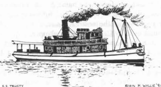
Figure 1: S.S. Trusty