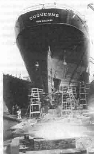
Fig. 5: The Duquesne , another Lykes Bros.-Ripley Steamship Co. freighter, in drydock in New Orleans.

before "Second" arrived from the machine shop. Yet Stuber had lost twenty to thirty pounds of steam.