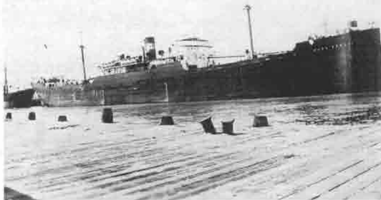
Fig. 3: The 5,527-ton West Hobomac tied up at Galveston, Texas.

As a member of the engine room crew, Stuber never expected to go up on the bridge. But one Sunday afternoon, the second mate allowed him to have a look around and even a turn at the wheel. "All I had to do was to turn the wheel from time to time to maintain a specific reading on the ship's compass. I turned it the wrong way the first time....Thousands of tons of ship under my direction — a great day for me!" The first voyage ended at Pensacola, Florida, for a regularly scheduled drydock for maintenance and painting