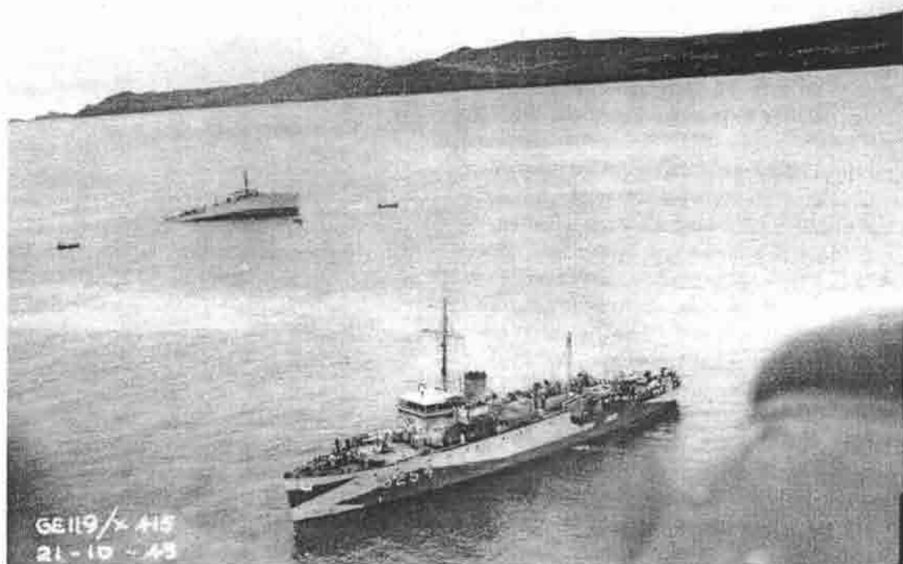
Photo 2: RCAF photograph taken on 21 October 1943, showing Chedabucto aground just off the south shore of the St. Lawrence. Other photographs in this series clearly show her painted up in light toned Western Approaches camouflage. The ship in the foreground is her sister HMCS Swift Current . When this photo is enlarged, it is apparent that the latter carried a smaller gun, probably a 12-pounder. (National Archives of Canada/ Neg. no. C144360).

of scuba divers out of Rimouski reported the recovery of the starboard propeller and the port anchor to the Receiver of Wrecks. 11 In 1964, thoughts of those CCM rotors and more importantly, reports of explosives being landed from the wreck led the Navy to send in a team of divers to remove some of the ammunition. 12