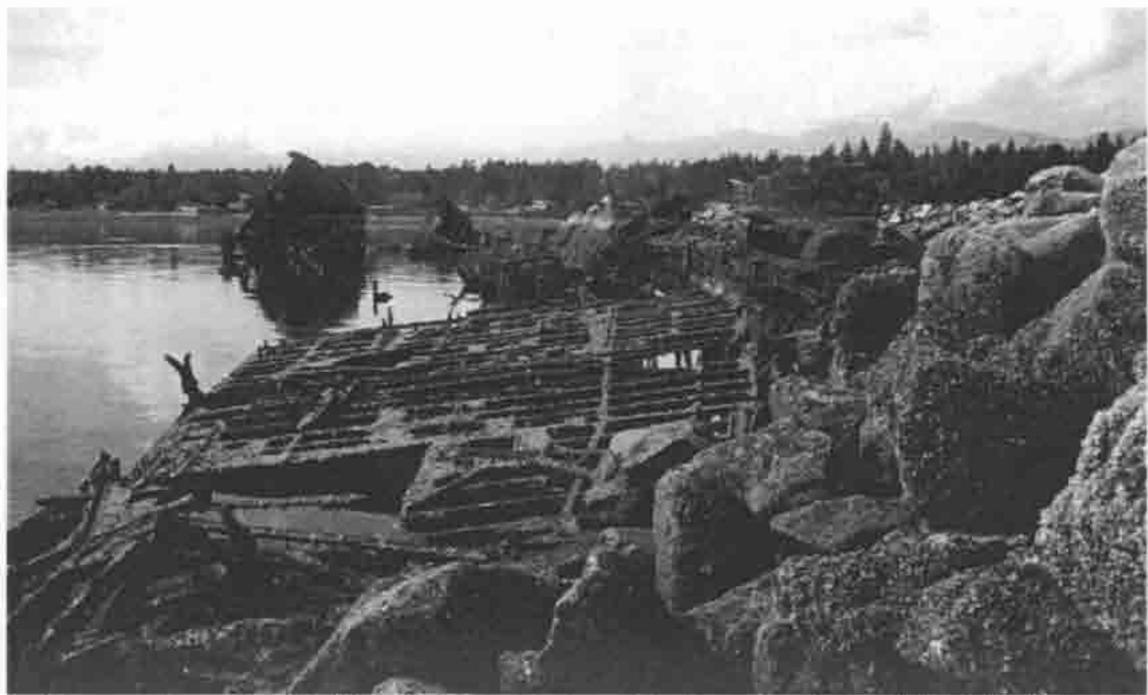
Looking across the remains of the frigate HMCS Eastview towards the Royston beach. From left to right in background: last of four-masted barque Comet (launched Port Glasgow, 1902), bow of frigate HMCS Dunver, with the CPR steam tug Qualicum (note boiler) lying below the bow of the iron ship Melanope.

The company soon discovered that a booming ground located on the Courtenay River tidal flats was a poor choice to dump and sort logs since the site was exposed to wind and weather blowing in off the Strait of Georgia. After a number of futile efforts to knock the swells down with a string of boomsticks and old donkey sleds hauled out of the woods the company decided to try using an old ship's hull instead.