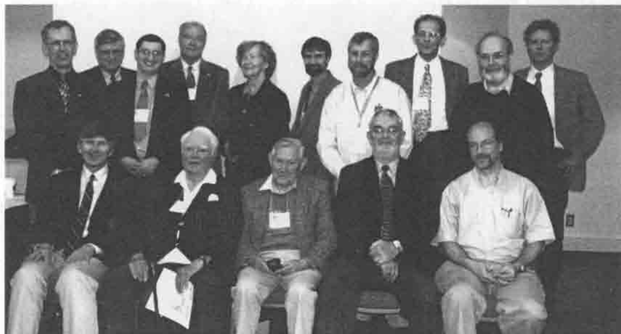
Speakers at the CNRS May 2004 Conference