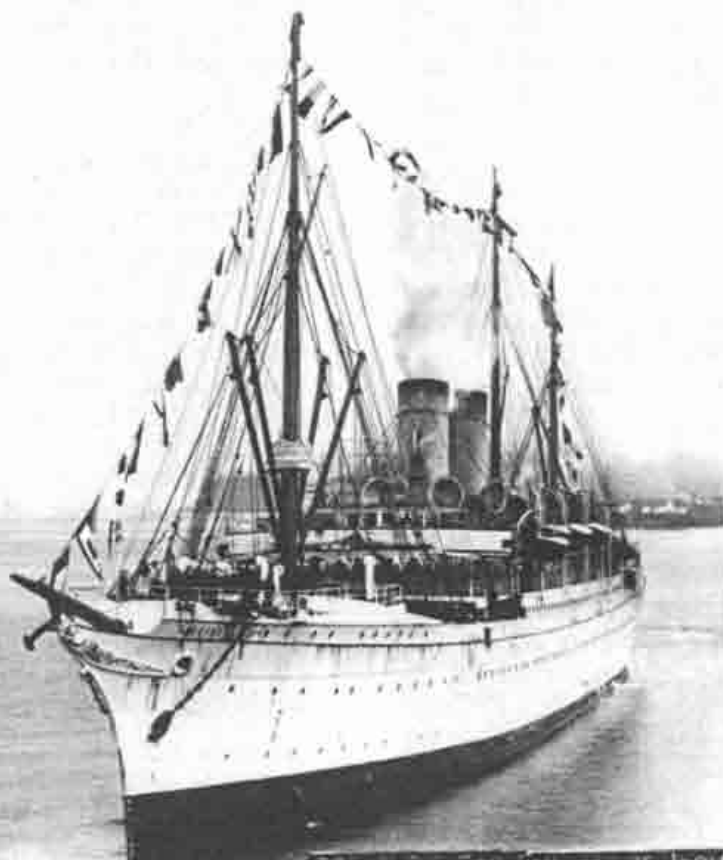
CPR's Emperor of India arriving at the Vancouver terminal, 28 April 1891 to inaugurate the Imperial Route to China.

Paramount to British Columbia entering Confederation in 1871 was our insistence that the Canadian government would build a rail line to the west coast, no easy undertaking for a nation as young as ours, but 15 years later the first train pulled in to Port Moody, at the head of Burrard Inlet. The company had already chartered a number