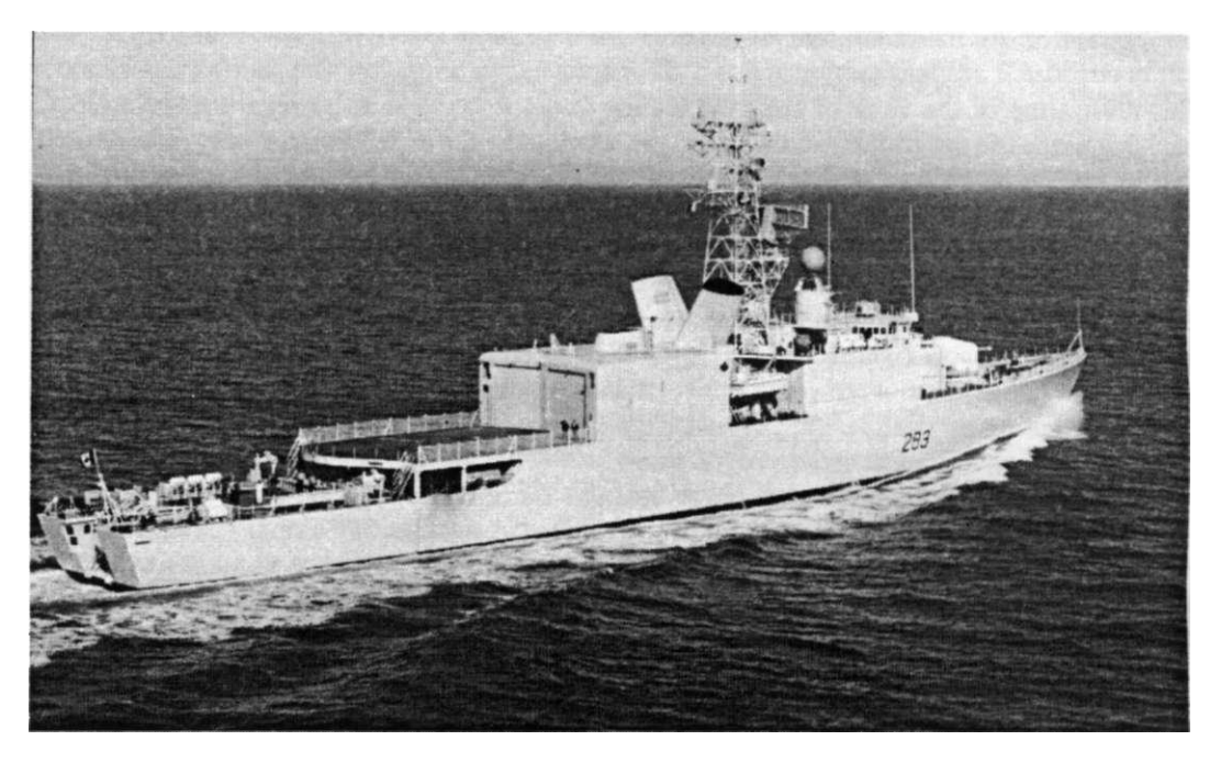
Figure 2: "Tribal-class Algonquin DDH-283"