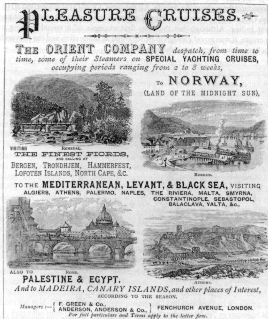
Figure 1: Advertisement.

Source: W. J. Loftie (ed.), Orient Line Guide (4th ed., London, 1890) xliii.