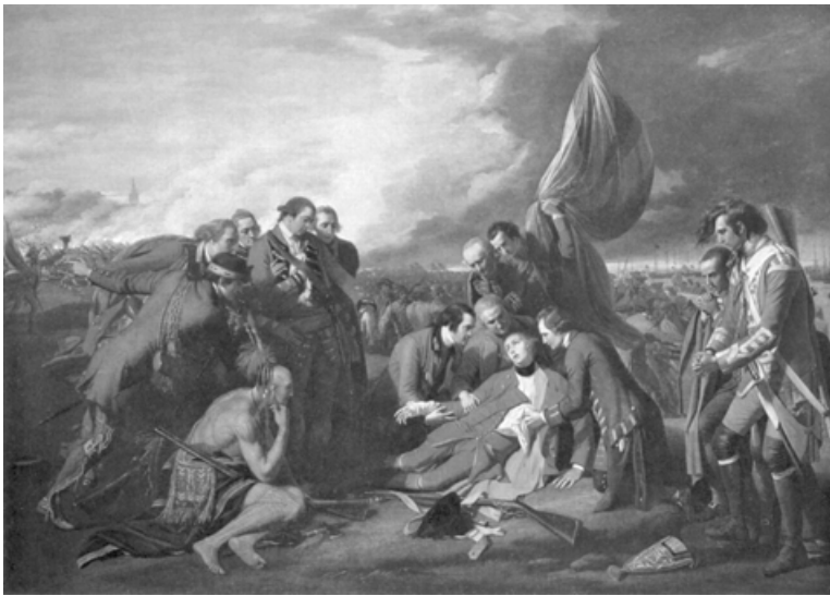
Illustration 3: The famous death of Major-General James Wolfe at Quebec, 13 September 1759, as conceived and executed by Benjamin West in 1770. One of the portraits of heroes in the throws of death it rivals many showing Nelson's exit from this world.

In addition to the customary conclusions that such an in-letter would report after a glorious action – that is, which naval officers and ships would sail for home or be detached on other assignments – Saunders made one further statement worth repeating here: “I have the pleasure also of acquainting their Lordships that during this tedious