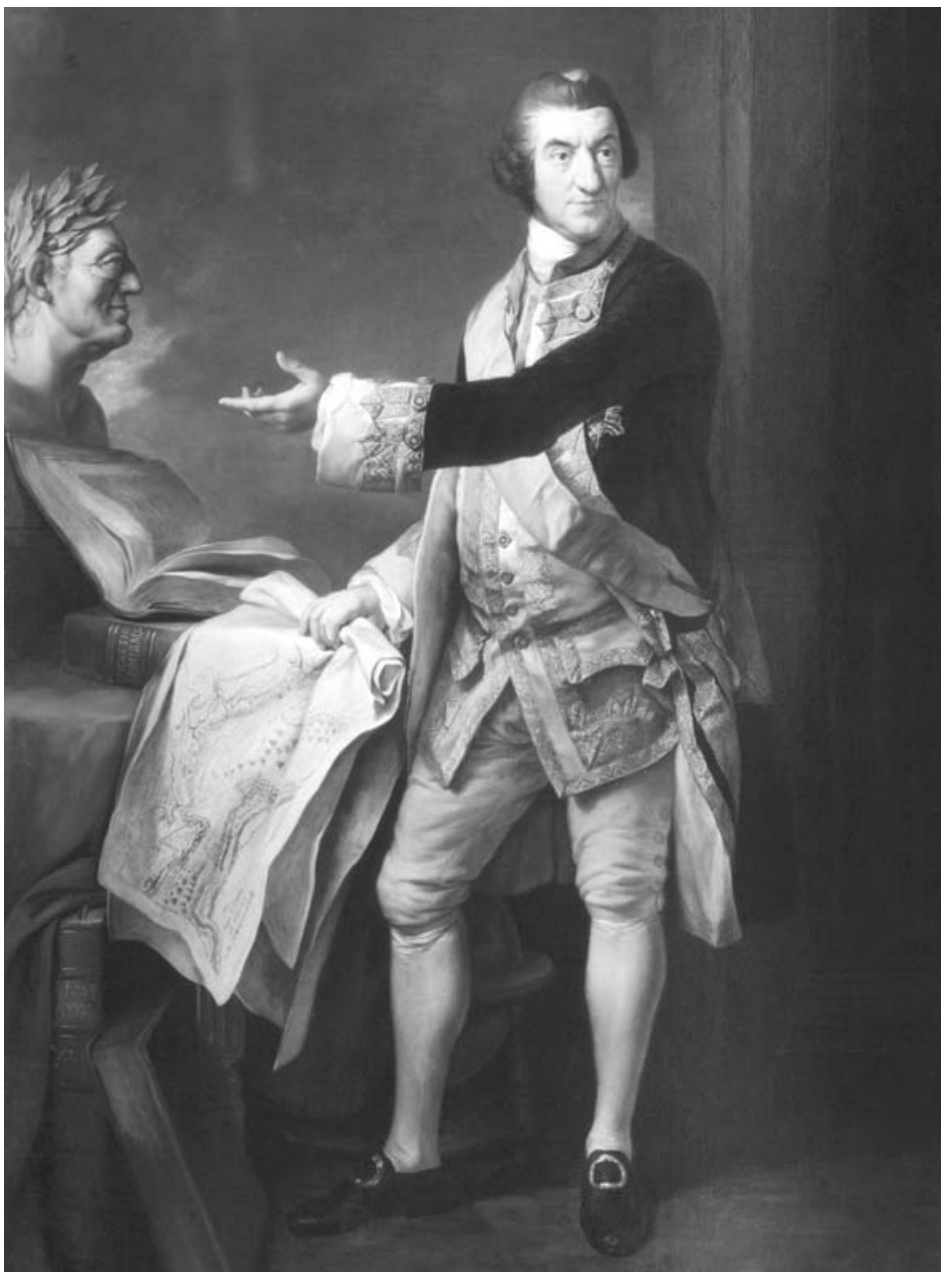
Illustration 4: In this 1765 portrait of Vice-Admiral Sir Charles Saunders, the artist, Richard Brompton, shows Saunders pointing out how British sea power has delivered the fruits of victory, Canada. Saunders prepared and published (by approval of the Admiralty) a great chart of the River St. Lawrence. This is shown in his right hand. Note the laureled head of a soldier who looks disinterestedly away from the sea environment: his concern is the land and the territory of empire.