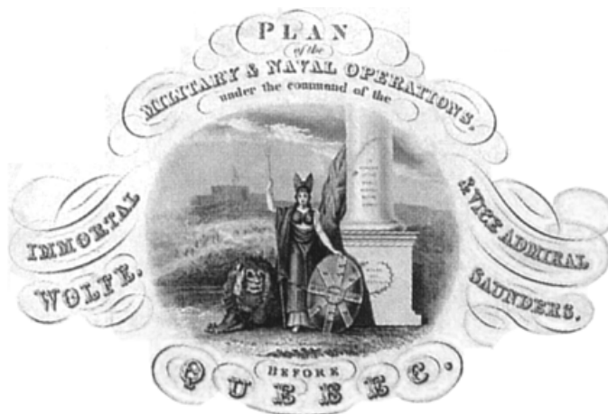
Illustration 2: Early 19th century vignette honouring Wolfe and Saunders. Artist unknown.

But that spot was terribly exposed, generally speaking downstream and downwind of certain French forces. The French sent fire ships down on them the following night but they were gingerly parried by British tars in boats. The fleet set up a communications system, landed the artillery on the Lévy shore and elsewhere, offloaded the barges and assault craft, ferried messages to and fro, and provided bombardment on occasion. Saunders also covered Wolfe's landing on the Île d'Orléans. As per their instructions, drafted by Pitt, Saunders and Wolfe worked closely and in concert. Still, there were strains altogether natural in the circumstances and given the personalities involved. Wolfe's failed attack near the Montmorency Falls on 31 July brought about the greatest strain between the two commanders. Wolfe blamed the Navy's inadequate covering fire, and wrote about it in a letter to Pitt. He let Saunders see the draft. Saunders objected, and Wolfe dropped the criticism, though he still believed the facts were as originally stated. Wolfe referred to Saunders as a "brave zealous officer." 28 In subsequent operations, including the most critical, boat work was outstanding, and seamen, doing the heavy hauling of empire, dragged one hundred of the army's field pieces to the heights of Quebec.