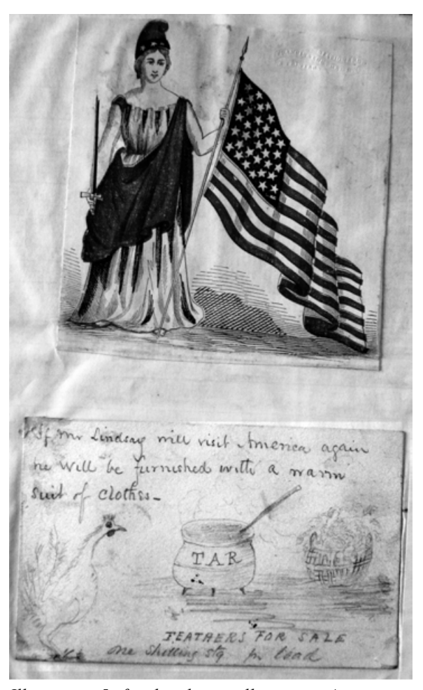
Illustration 5: for details, see illustration 4, previous page.

During that vear Lord Russell sent Lindsay to Paris several times to discuss French enforcement of Navigation Laws. During these meetings, Lindsay developed a good relationship with the Emperor Napoleon III and was impressed by his wide knowledge of transport services during the Crimean war. 82 The emperor remarked that the United States naval blockade. designed to prevent European supplying merchants strategic materials to the Confederate States in exchange for cotton, was losing France more trade than it was Britain, and therefore should not be respected.<sup>83</sup> He added that since the British ambassador to France, Lord Cowley, always dismissed French suggestions about the course they should take towards America, he had no faith in the official channels and any further meetings should be with Lindsay alone.