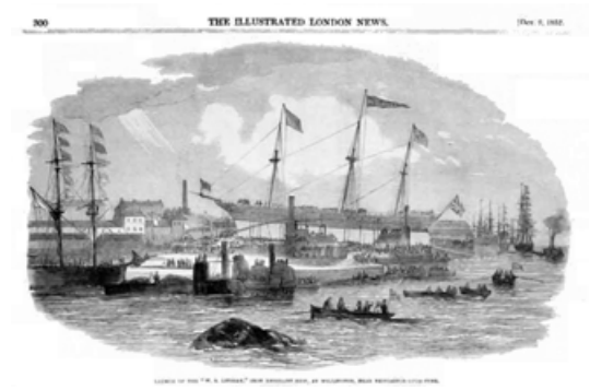
Illustration 2: Launch of Ship W. S. Lindsay. Illustrated London News, 9 October 1852.