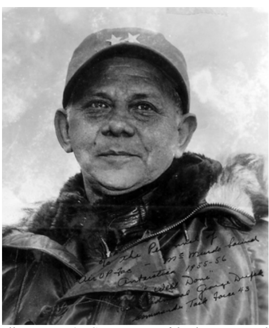
Illustration 2: George J. Dufek, the renowned naval aviator and polar expert, as a rear admiral in the US Navy in 1955.

Planning documents reflected the spirit of cooperation and accommodation