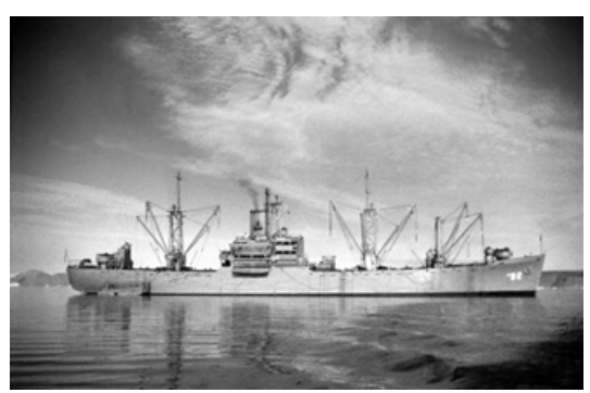
Illustration 4: The Andromeda-class cargo ship USS Wyandot "in all its glory," 1948.

Undeterred by this near disaster, another attempt was made to unload the supplies for Resolute on 20 August. Heavy ice again rolled into the bay, stymied all progress, stranded forty men on the beach, and almost crushed a landing craft. Once more Wyandot was threatened by ice and the icebreaker had to tow the ship clear. Still unable to finish unloading supplies at Resolute, Eastwind left once more for the station at Slidre Bay on 25 August and reached the site three days later. It landed supplies there without incident — the first part of