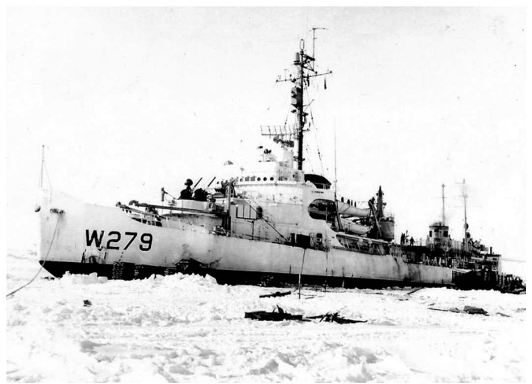
Illustration 7: The Wind-class icebreaker USCGS Eastwind (WAG-279).

icebreaker they should construct for service in the waters of their Archipelago. Although they had decided to construct such a ship, no research on icebreakers was carried out in Canada at the time and the government was dependent on outside sources of information. From Task Force 80 they found that Eastwind and Edisto rolled badly in open waters, caused by fine bows that fell into the trough of the sea, while their much fuller stern rose. With insufficient body and buoyancy to lift the bow quickly enough, the ship cut into the next sea below, which caused a great deal of water to crash onto the foredeck, occasionally damaging the deck plates. In the ice the bow created a small wave, a distinct disadvantage in icebreaking operations. All of this indicated that a fuller form at the water line forward, with higher and flared bulwarks, would be advantageous in ice and would keep the ship dryer in a seaway. The American icebreakers also caused floating ice to form up in their wake during ramming operations, a clear indication that the stern sections required modification to push floating ice out of the wake. Finally, the Canadians learned that the speed of the propellers had to be controlled to prevent