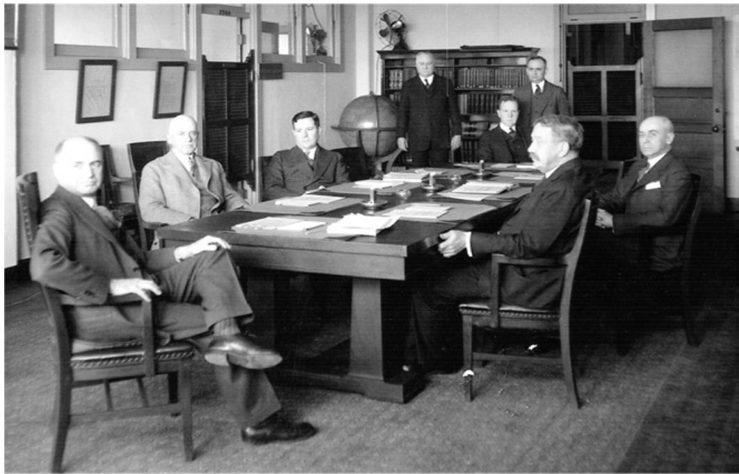
Illustration1: The General Board in 1932 in the old Army-Navy Building. Note the civilian dress. Photo NH 50175, courtesy of the Naval Historical Center.

for standing armies and military dictators (like Oliver Cromwell) as well as the young republic's own perceived experience as a mistreated British colony.<sup>1</sup> The Constitution of the United States specifically enjoined against the raising of permanent armies for more than two years and Bill of Rights amendments II and III enshrine a militia and eschew military quartering, respectively. However, the same Constitution permitted the establishment and maintenance of a Navy—without codicils. When the precursor of a professional general staff emerged in the United States in the last half of the 19<sup>th</sup> century, it emerged in the Navy Department not in the War Department or the United States Army.