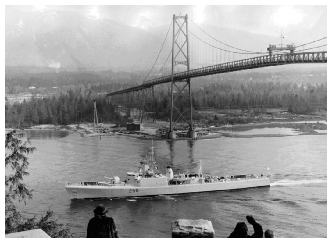
Illustration 8: One of four destroyer escorts started by Burrard Dry Dock in the early 1950s, HMCS Kootenay, leaving Burrard Inlet underneath Vancouver's Lion's Gate bridge. The warships, though a troubled contract for the government in terms of costs and delays, advanced the company's reputation with the Royal Canadian Navy for domestic-sourced shipbuilding. (Madsen)

competitor or a genuine attempt to add capacity, the strategic business decision positioned Burrard Dry Dock as British Columbia's leading shipyard. The wartime south yard in Vancouver proper was closed down and all activities split between the remaining North Vancouver and Esquimalt locations. Burrard Dry Dock finished work on small China coaster freighters, built one government-financed cargo freighter with diesel engines for Canadian National Steamships Line, and brazenly secured an order for eleven coal-carrying ships (out of a contract for fifteen) from the Canadian Export Board on behalf of France.<sup>86</sup> These ships still reflected a mix of riveted and welded construction. Further government orders came for an all-welded Department of Transport tender and lighthouse supply vessel for service on the British Columbia coast and anti-submarine destroyer escorts of Canadian design for the Royal Canadian Navy. The latter suffered from time delays, cost over-runs, and block obsolescence. When eventually finished, the