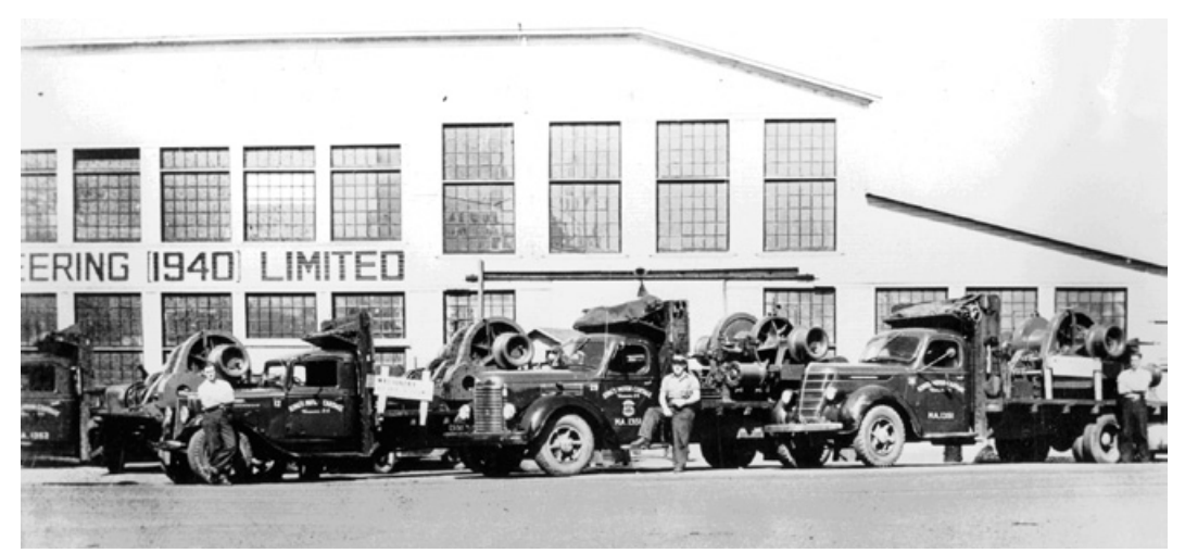
Illustration 5: Windlasses manufactured by Heaps Engineering (1940) Limited loaded onto flatbed trucks for delivery to nearby Vancouver shipyards to meet progress schedules. Wartime saw more extensive use of sub-contracting to industrial firms and pre-fabrication of components in British Columbia's Lower Mainland. (New Westminster Public Library)

winches and anchor windlasses in expanded wartime plants.<sup>66</sup> These items were then stored until shipped to designated shipyards when ships neared completion. West Coast Shipbuilding contracted sister company Hamilton Bridge to fabricate large bulkheads and upper ship parts positioned into place by cranes on building ways.<sup>67</sup> Burrard Dry Dock and North Van Ship Repairs employed a similar system, but to a lesser extent due to the constraints of geography and crane lifting capacity. The staging of sequenced concurrent building and fabrication became hugely important. Yarrows, by now entirely devoted to naval warship construction, focused on building revised twin screw corvettes called frigates. The revised frigate, taken from the British and redrawn by the Americans, was an escort ship for convoy work and anti-submarine warfare incorporating an all-welded design and considerable pre-fabrication.<sup>68</sup> This mode of production allowed for faster completion and delivery by lesser skilled workers.