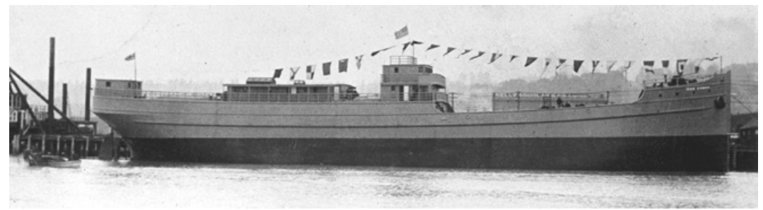
Illustration 1: Clean hull lines of War Comox, typical example of the standardized war-emergency wood cargo vessels built in British Columbia to an American design, shortly after launch from a shipyard on Poplar Island in April 1918. Note the American flag flying over the superstructure.

construction of steel cargo-carrying vessels.<sup>24</sup> The strategy served a fourfold purpose: employment eased back to normal levels by staggered work; business and industrial leaders cheered the economic development and potential; greater participation in shipping routes and international trade serving Canada challenged the stranglehold of foreign companies; and, similar developments fostering and protecting a fledgling U.S.-flagged merchant marine apparently pointed the way.