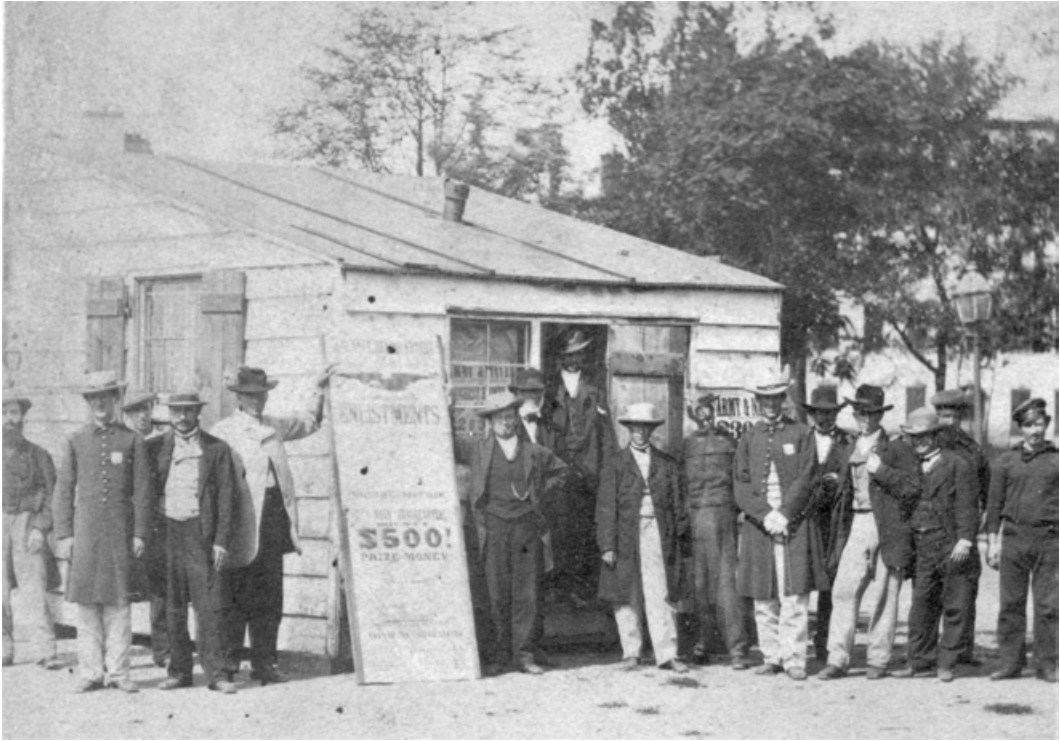
Illustration 2: “Bounty brokers looking out for substitutes”—the only known photograph of bounty brokers plying their trade.

and whether the man was a volunteer or a substitute might all be filled out at a later point. Recruits generally signed for agreed fees paid in advance by brokers and rarely even saw their enlistment papers. 28