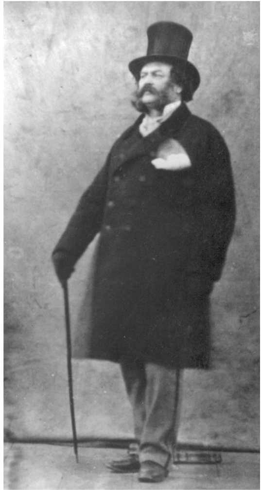
Illustration 5: Moses H. Perley, Her Majesty’s North American Fishery Commissioner, ca. 1860.

Moses Perley is an important figure in the history of the fisheries. Asked by government to report on the fisheries in the seas around New Brunswick, he produced several impressive studies notable for their statistical data, of course, but studies which are remarkable too for the literary style with which Perley depicted the nineteenth-century fisheries, British and American, and maritime scenes in particular with color and clarity. Determined to protect colonial fisheries, Perley accepted American entry into provincial inshore waters only because he thought it would improve trade relations with the United States for all of British America. And, once he became British commissioner under the reciprocity treaty, he read its provisions strictly in order to protect the interests of colonial fishermen. Without question, Perley’s story is integral to the history of the nineteenth-century North Atlantic fisheries, and it is a story that needs to be told.