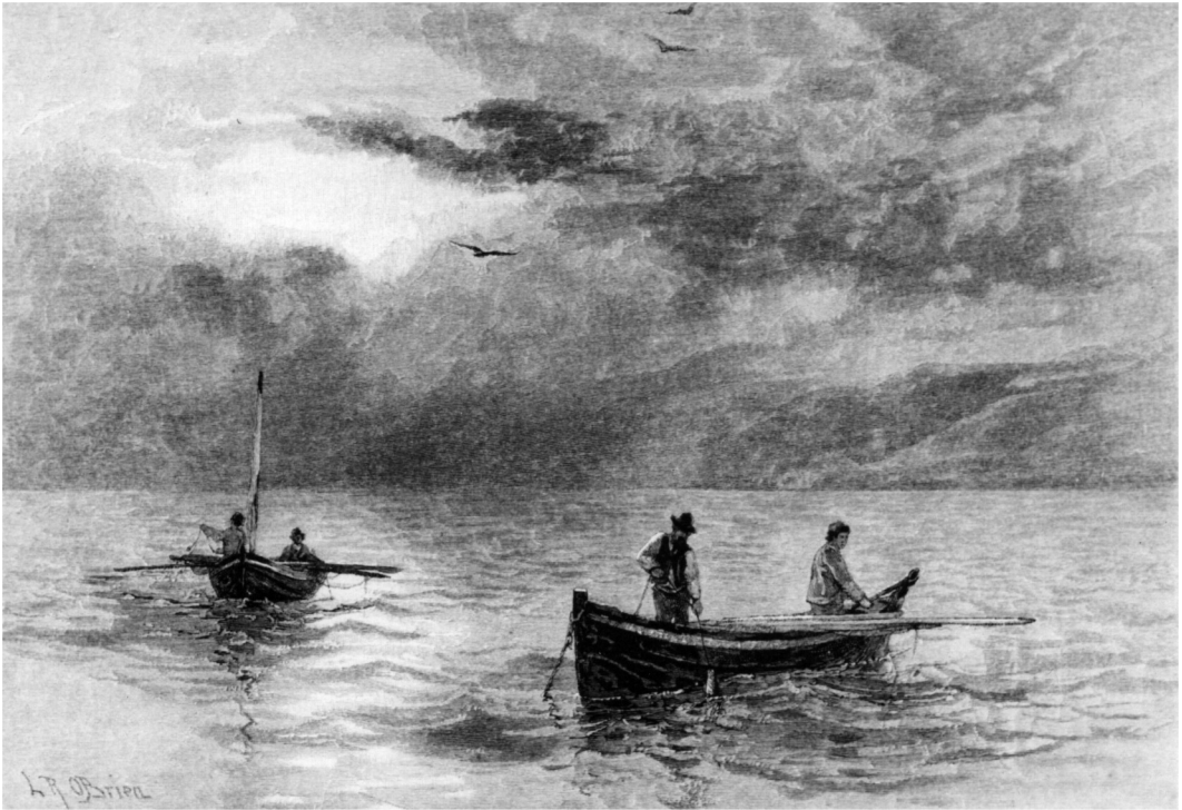
Illustration 2: Cod-Fishing, G.M. Grant, ed., Picturesque Canada: the Country as it was and is, (Toronto, Belden Bros., 1882), 739.

with little heed to the limits to which they were restricted by Treaty, pursued their business unmolested and rarely left without full and valuable fares.” 8