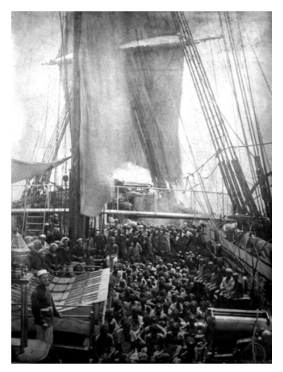
Slaves rescued from a dhow aboard HMS Daphne, 1868.

In 1889. eleven European powers, as well as Turkey and the Congo "Free State" (actually a personal colony of the King of Belgium) met at a conference in Brussels, Belgium, to discuss the suppression of the Indian Ocean slave trade. The result was an international convention, signed by the thirteen countries, known as the "General Act of the Brussels Conference Relative to the African Slave Trade, signed at Brussels, July 2, 1890."<sup>6</sup> Britain acceded to the convention in 1892. The convention recognized an established practice of granting the use of the maritime flag of the European powers to local boats and ships owned by nonpeoples regarded European as "protégés."<sup>7</sup> Under the convention the French undertook to ensure that French flagged native-owned vessels did not transport slaves, and the British pledged to prevent ships under their flag from engaging in the trade. The convention also declared that European powers