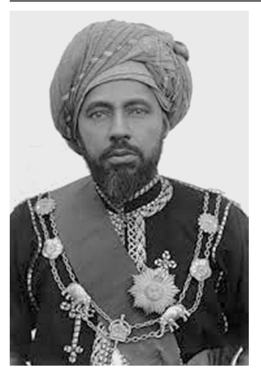
Sayyid Faisal bin Turki, (1864 – 1913).

enclave of Obokh. Others simply reported that their parents or other family members had protégé status and that it devolved upon them as well<sup>12</sup> Others were not entirely sure how they had obtained the status.