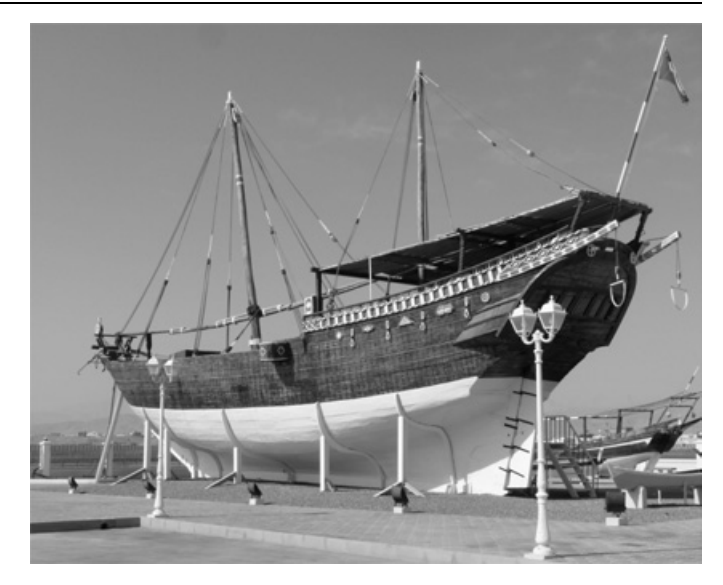
Replica Sür dhow on display.

Under the rules of the PCA, each of the two parties could nominate an arbiter, not from their own country, from a list of all the arbiter panel appointed to the PCA by all the signatory nations. In 1905, the potential pool of arbiters numbered about forty (the number varied as members died; most signatory nations nominated between two and four individuals to the pool, although a few failed to nominate any). Procedure