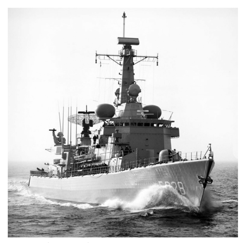
Hr. Ms. Van Speijk (F828)

repeatedly enable the Navy Board to frustrate government interference in its spending, while additionally it could rely on allied commitments to enforce approval for its fleet program expenditures.<sup>21</sup> NATO would be of essential influence and can therefore be considered as the fourth pillar of Dutch post-war naval shipbuilding.