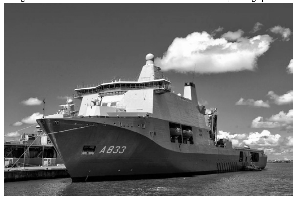
Karel Doorman (A833)

It is not irrelevant to point out that at the time the LCFs were ordered, the economy was booming and financial obstacles were of secondary importance. But the world was moving to different and more turbulent times. In the first years of the 21st century the call for defence cutbacks increased and the ministry was forced to reorganise and contract the armed forces time upon time. In these uncertain times the continuous replacement policy of the RNLN building programs was no longer obvious. With the active reorientation of Dutch security policy in the New World Order and the consequent far-going reorganization of the Netherlands armed forces in 2005, the grip of the