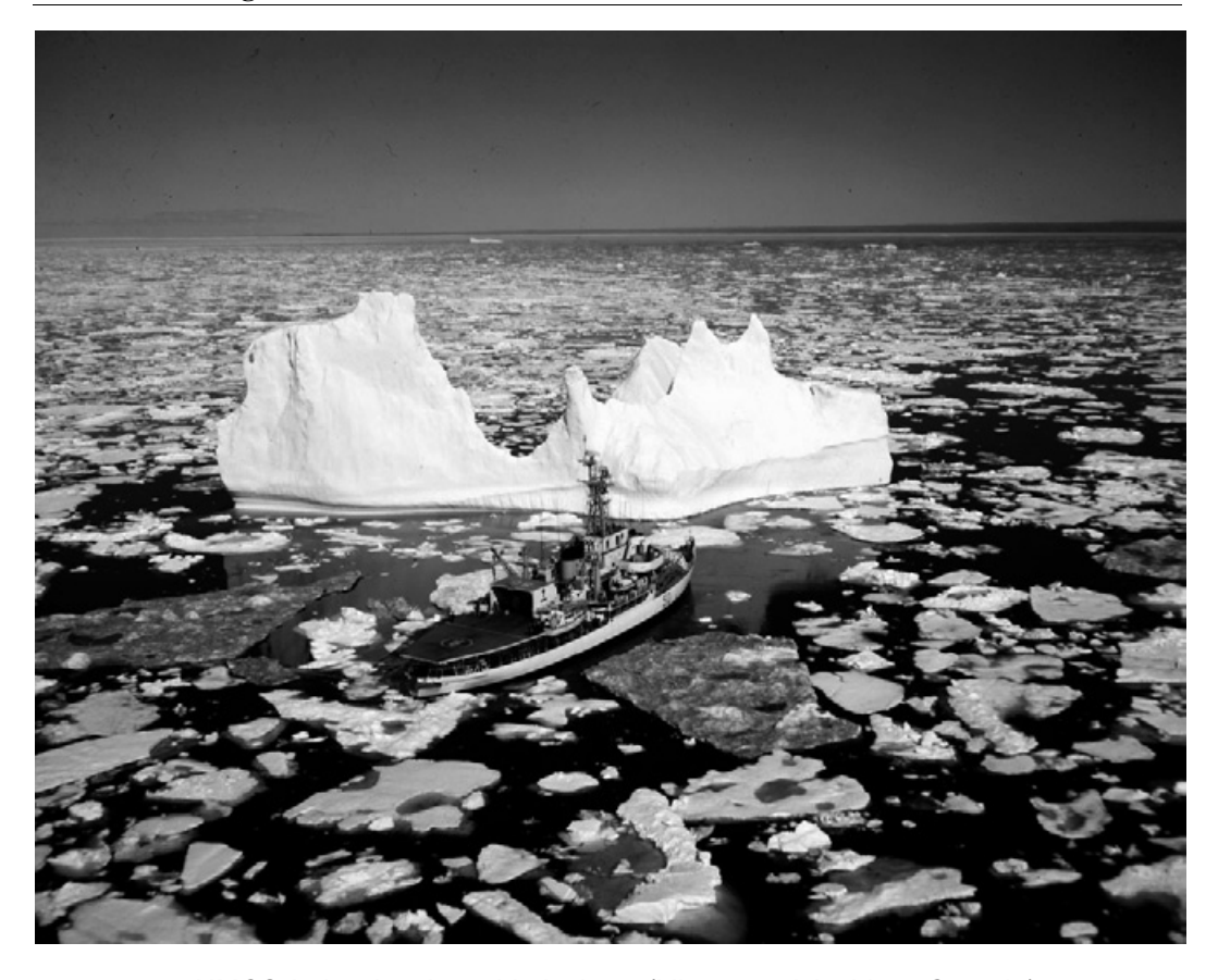
HMCS Labrador alongside iceberg

growing and became known to many outside his small circle of Arctic veterans. In April 1952, he was asked to present the naval aspects of Arctic combat at the United Services Institute conference in Montreal.<sup>31</sup> Then, in August 1953, he was brought to headquarters in Ottawa as the staff officer (Arctic) as the RCN began to prepare for a more concentrated venture into Arctic operations. His work included coordinating the maiden voyage of the navy's new icebreaker, HMCS Labrador , nearing completion at the shipyard in Sorel.<sup>32</sup>