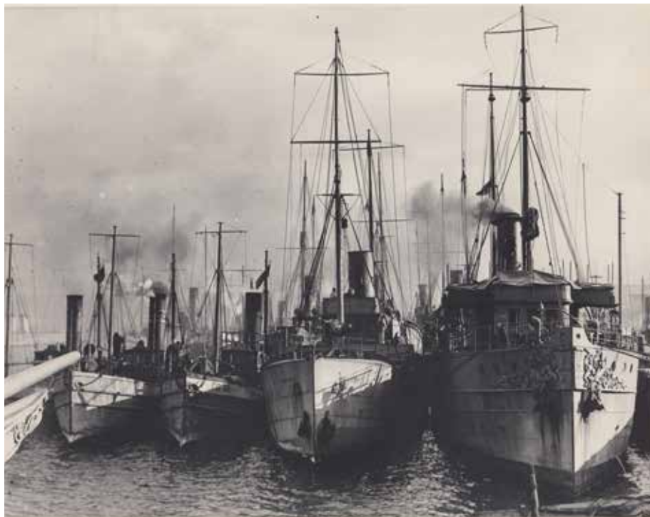
Royal Canadian Navy anti-submarine vessels at Halifax, probably 1918. From right to left, Cartier, a government hydrographic survey ship taken up by the navy; Givenchy, a steel trawler; and two wooden drifters, the latter three built in 1917 to meet the U-boat offensive.