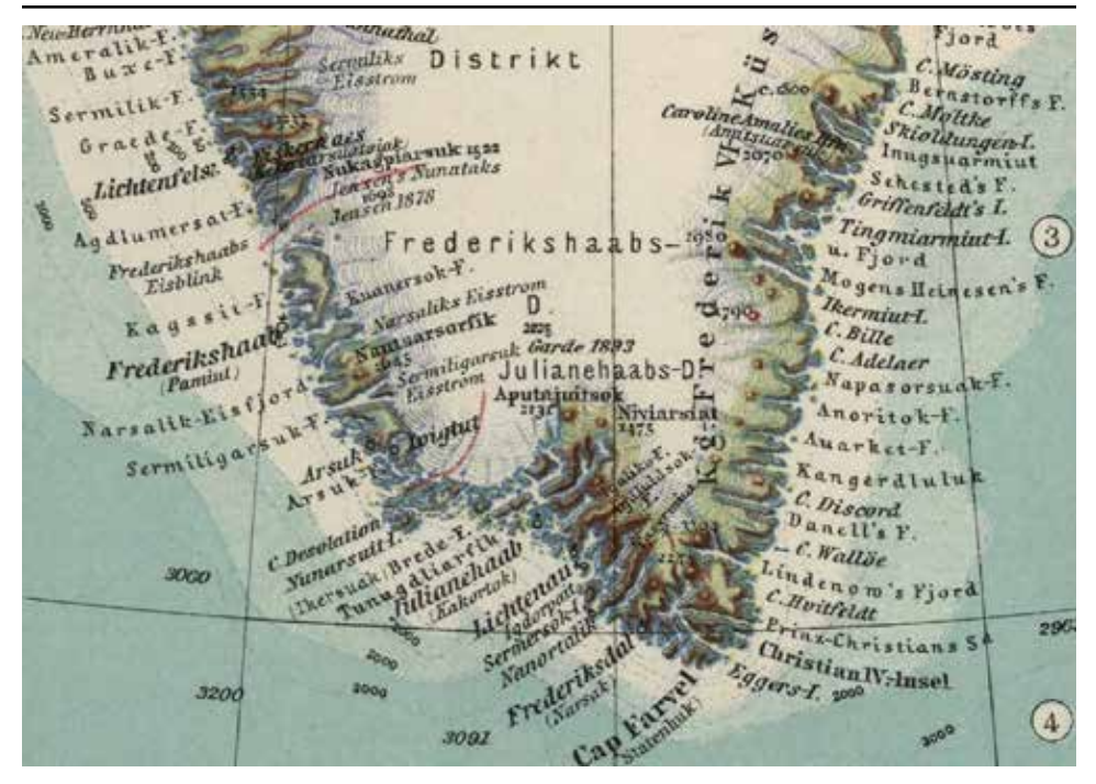
Detail of southern Greenland, circa. 1940 (Stielers Hand-Atlas, (1940) Plate 39)