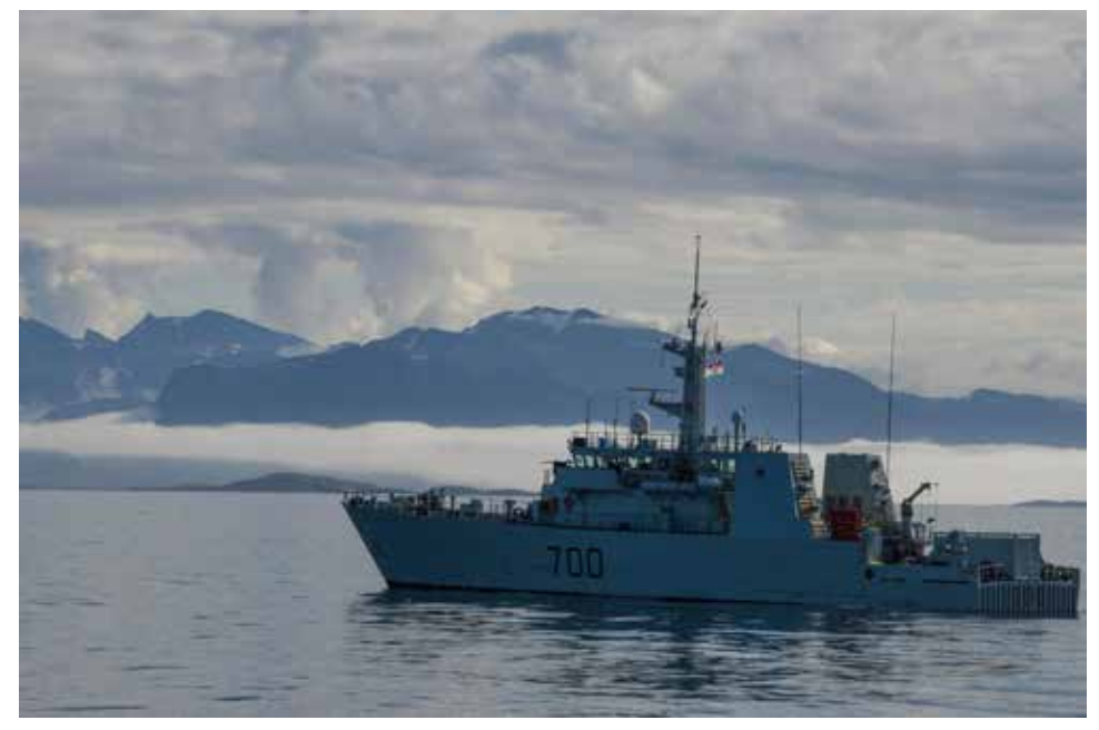
HMCS Kingston sails past the mountainous coast of Greenland during Operation Nanook in 2018.

welcomed the US Department of Defense's "Statement of Intent on Defense Investments in Greenland" and its promise of future cooperation, "based on a mutual understanding that the United States' military presence in Greenland should benefit Greenland and the Greenlandic society to the maximum extent possible."<sup>172</sup> Amidst the rising chorus of Western concerns about China's vision of a "Polar Silk Road" running through the Arctic, Russian and Chinese militarization threatening the interests of the US and its allies in the region, strategic resources in the Arctic, and Greenland's political aspirations for full independence, the world's largest island remains a site of geopolitical intrigue.<sup>173</sup> Canada has no aspirations to assume control over its eastern neighbour, but it certainly has vested interests in Greenland's security, supply chains, and the maritime approaches to northeastern North America.