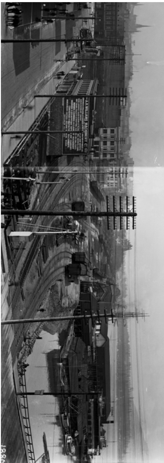
Foot of Carrall Street in 1908, showing Union Steamships Dock and Alexander Street at Columbia.