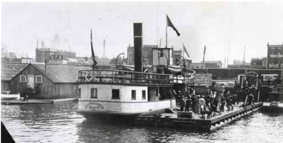
SS North Vancouver ferry at Union Wharf in 1903.

Union Steamships Company and North Vancouver for Senator , which made six scheduled trips a day. 66 The ferry had a smaller, customized float built on the east side of Union Wharf. From this float there was a ramp leading to Union Wharf that was so steep when the tide was out that the kindly old captains needed to be on hand to help elderly passengers ascend the ramp. 67 In the summer of 1899, Union Steamships pulled Senator off the run and discontinued scheduled ferry service. The District of North Vancouver responded by introducing its own ferry which sailed daily to Union Wharf, SS North Vancouver . 68 When train traffic increased, empty CPR train cars would sometimes block the entrance to Union Wharf, which caused people to occasionally miss the scheduled North Vancouver ferry sailings, or else attempt to climb under the cars. 69 Gradually, the North Vancouver ferry