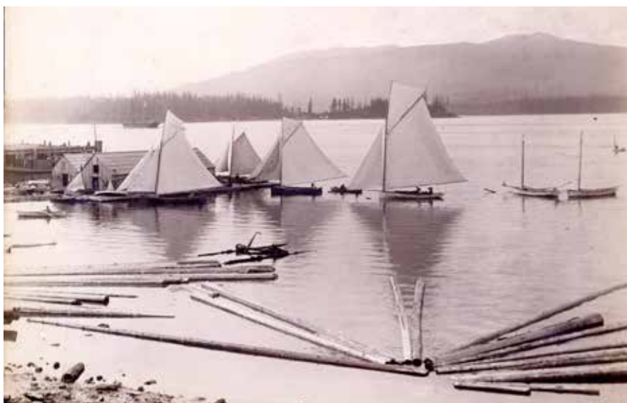
City Wharf and Linton Boathouse. Boats identified left to right: SS Senator, Robert Kerr, St. Patrick, Laurel, and May.

Inspired by logging camps, this ungoverned, village habitation of Gastown subsequently became the nucleus from which the new city emerged. The original village faced the present harbour and was bounded by Carrall and Cambie streets. This area was previously known as Lek'leki and served as a Salish corridor from the foot of Carrall and Abbott through to False Creek, providing a high-tide route where a canoe could be portaged, thus avoiding the long paddle around the First Narrows. 7 The colonial-era survey of Gastown extended the Carrall Street right-of-way over the Burrard Inlet foreshore and into the ocean, while the beach itself was overlain by a surveyed subdivision. The description “foot of” followed by a street name was part of the vernacular of early Vancouver to describe locations, where many streets connected with the high-water mark of the ocean, so the “foot” usually referred to the place where the street connected with the water. The eastern side of Granville townsite, this same six-square-block townsite later called Gastown, was considered the best place for docks to be located or to land a boat, so the main beachside area for arrival and loading in Gastown was from Carrall to Cambie street. 8 Henry Cambie himself pointed out the foot of Carrall Street as