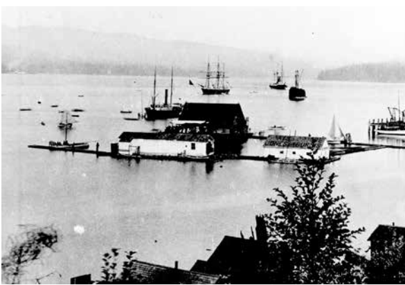
Andy Linton's boathouse and City Wharf.

Carrall Street right-of-way. Approval came months after by Vancouver council, in the form of the City Wharf bylaws, while the wharf builders struggled to meet the requirements imposed by Ottawa. 36 The pretext for first extending the platform at Carrall Street was to accommodate the city's first fire engine, which arrived for the Vancouver Volunteer Fire Brigade in August 1886. 37 One practical reason for building City Wharf was to institute a suitable fire protection infrastructure in the weeks following the devastating Vancouver fire of 1886. 38 City Wharf hosted the flourishing dockside life because the demands of the Vancouver Fire Brigade were fairly light.