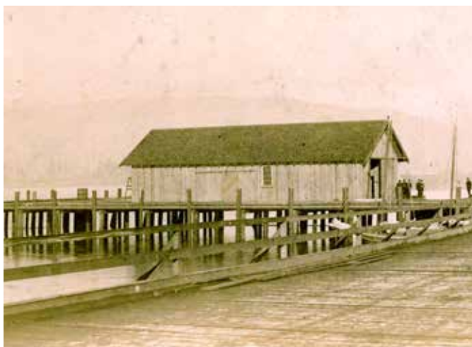
City Wharf at the foot of Carrall Street. (Image Bo P40 courtesy of Vancouver City Archives)

Wharf bylaws while Vancouver politicians also lobbied Ottawa directly for lenient treatment of the wharf. 47 Instead of proceeding with a purchase, however, city politicians gently fostered the need for a voter plebiscite while Mayor Oppenheimer sought private arrangements for City Wharf to be sold.