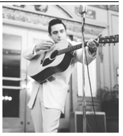
Johnny Cash aiming his weapon – his trusty Martin D-28 guitar – for Sun Records publicity shot in 1956

Cash stood first among equals in developing the unique sound and image, which resonated among a variety of audiences. Most comfortable in some kind of uniform, Cash and his band adopted black suits – often with western frills and rhinestone motifs. Cash also knew from experience that uniforms simplified logistics for maneuvering forces together – such as in the circuslike atmosphere of a traveling band. Black outfits obscured the sweat while conjuring an aura of mystery as amplified by the powerful sounds and movement on stage. To stand out, Cash often wore a black shirt with a matching tie