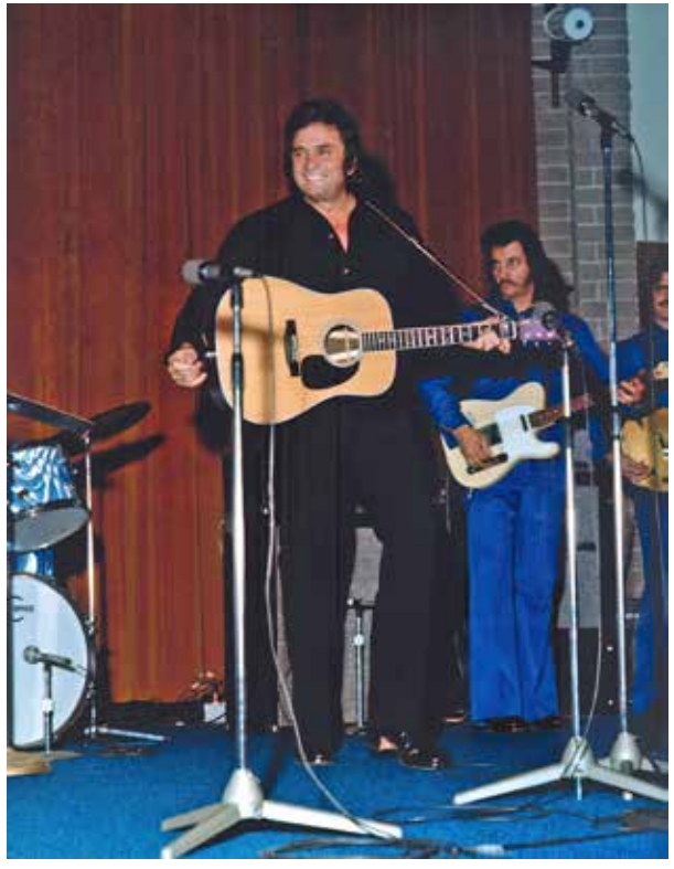
J.R. "Johnny" Cash on Stage in Spruance Hall at the Naval War College on 17 March 1975.

the role of American sea power into the twenty-first century – as recorded in the recently rediscovered audio from the undocumented performance by the "Man in Black" on St. Patrick's Day in 1975 at the Naval War College in Newport, Rhode Island.<sup>3</sup>