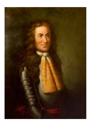
Sir Edmund Andros. Portrait by Frederick Stone Batcheller.