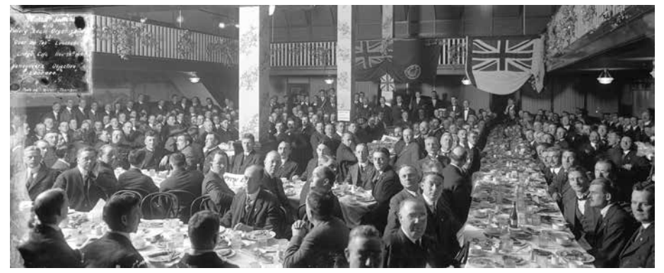
Admiral Jellicoe with Victory Loan Organization at "Over the Top" Luncheon at the Lodge Café in Vancouver on 15 November 1919.

approaching ill-mannered. <sup>105</sup> The fact that Jellicoe had not been afforded a copy of this assessment can be explained as a combination of bureaucratic muddle as the RN struggled to adapt to the post-war world and the sharp budget cuts then contemplated and soon imposed. The latter is perhaps more likely, albeit the low regard of Jellicoe held by Wemyss may have contributed. <sup>106</sup>