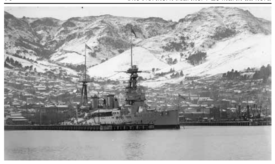
HMS New Zealand in Lyttelton Harbour, New Zealand, 2 September 1919

Zealand are drawn up with the object in view.<sup>97</sup>