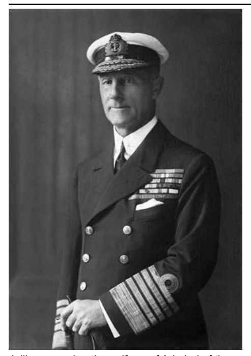
Jellicoe wearing the uniform of Admiral of the Fleet, a promotion he was given on 3 April 1919. the authority of the RN admiral the Australia Station,

This environment gave rise a renewed push by British politicians for assistance from the Empire in imperial defence. The fundamental argument was that all components of the Empire benefited from imperial defence in terms of security, particularly protection of trade, and hence should contribute something to its maintenance.6 One of the themes that arose out of these notions was an initiative to create an "Imperial Royal Navy" by securing the aid of the Empire as an active element of Imperial Defence.7 The dominions were willing to consider this question, with Australia and New Zealand providing a subsidy, since 1887, for the maintenance of an "Auxiliary Squadron," under commanding the Australia Station, designed to help protect both colonies