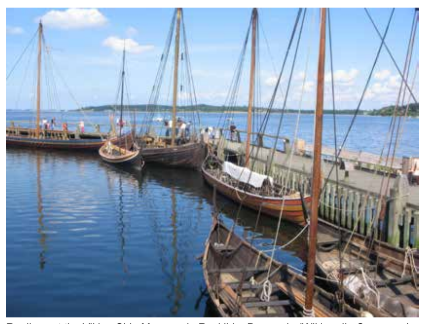
Replicas at the Viking Ship Museum in Roskilde, Denmark.

To summarize the circumstantial technical evidence, the húsasnotra or hnísa was so vital a piece of nautical gear that a broken one had to be replaced in the middle of events of a marked conflictual character, suggesting that a warship would be impaired without it. The length of timber had to be chosen