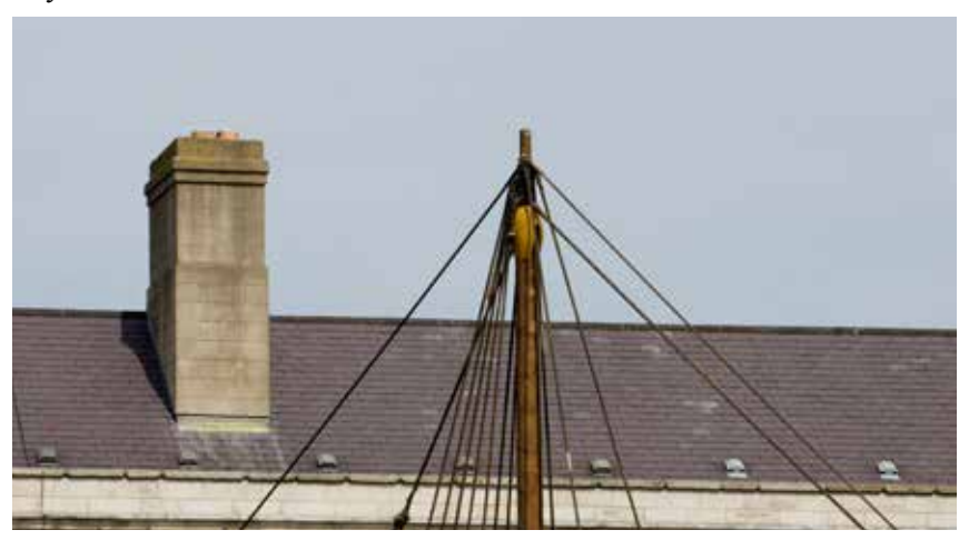
Havhingsten fra Glendalough ("Sea Stallion from Glendalough") is a Danish reconstruction of Skuldelev 2. The original ship was built around 1042 near Dublin. The reconstruction was built at the shipyard of the Viking Ship Museum in Roskilde, Denmark from 2000 to 2004.

The last term listed in Snorri's ship parts and synonyms is húnspænir (st. 10). <sup>19</sup> Spánn generally meant "chip, shaving," but here seems to reference slat-like wooden shims or wedges, which were used to fix the detachable snotra in place atop the mast. We should then imagine the housing for the block as having a socket ( húnfalr ?) at the bottom to take the mast. This last, "clinching" detail in Snorri's listing seems to give the part added prominence. Despite the lack of archaeological evidence, the builders of the replica of Skuldelev 2, the thirty-meter-long warship, incorporated a housed halyard block at the top of the mast, as detailed the in photograph below. <sup>20</sup> The original warship was built in 1042 near Dublin, only a few decades after the dates of the Vinland voyages. Pulley technology was thus well known in western Europe around the year 1000.